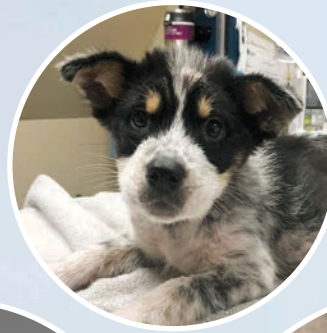
OSCAR Adopted 2019

You're part of a special group of people. You care about the animals in our community, and you know the comfort and joy they can bring to us and to our loved ones.