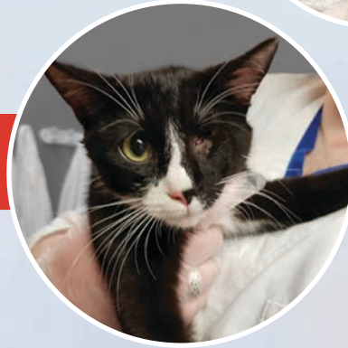
TWITCH Adopted 2020