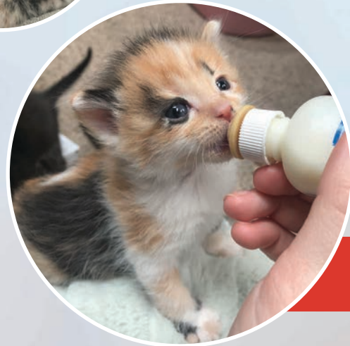
BUBBLES Adopted 2020

Perhaps you know the joy of arriving home to a wagging tail and sloppy kisses, to purrs and cuddles from an animal who loves you unconditionally. Even if you don't own an animal, you know the comfort and joy they can bring to people's lives.