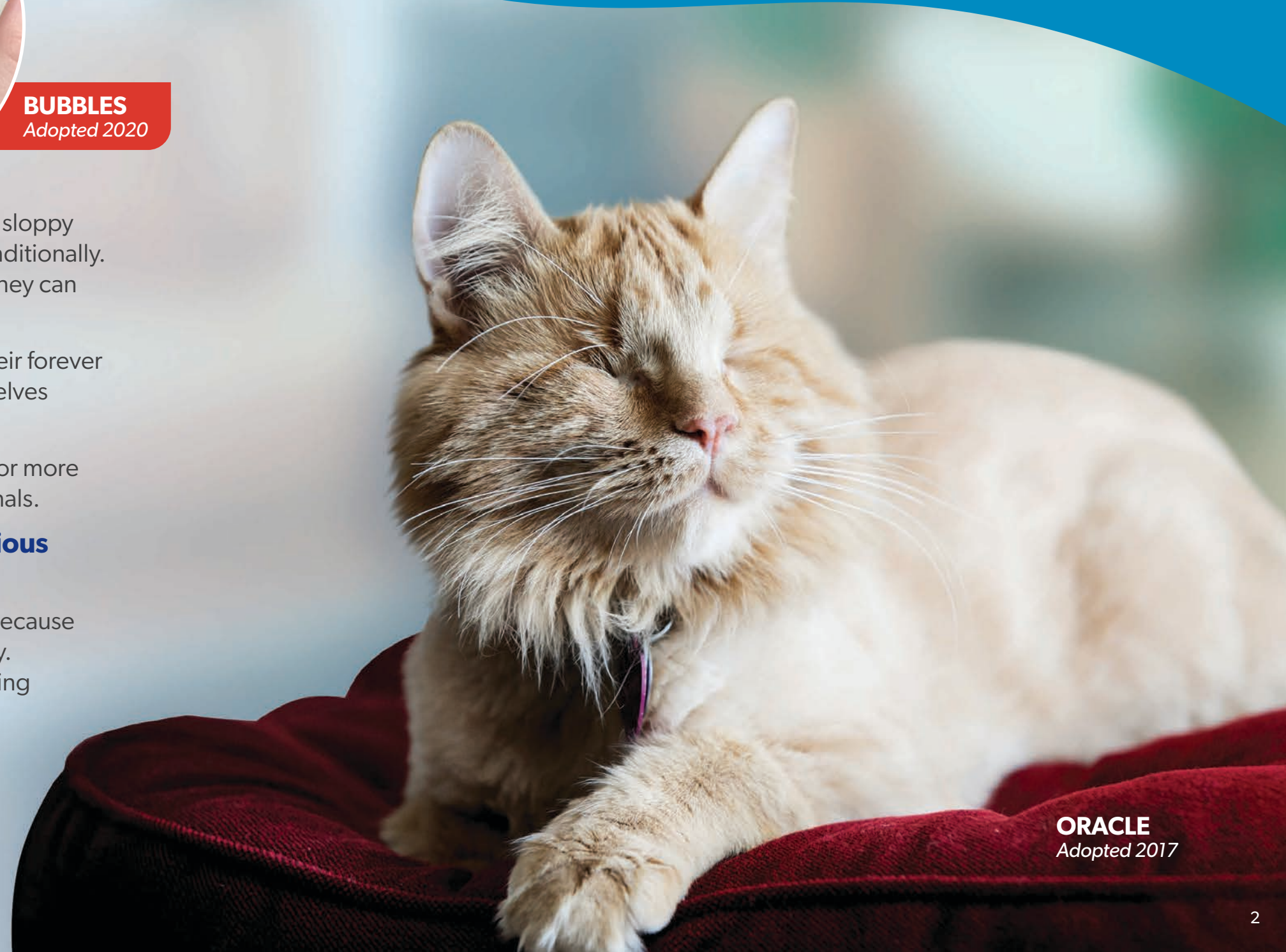
ORACLE Adopted 2017

Our animals need and deserve a new home, and they need your compassionate support to make it happen.